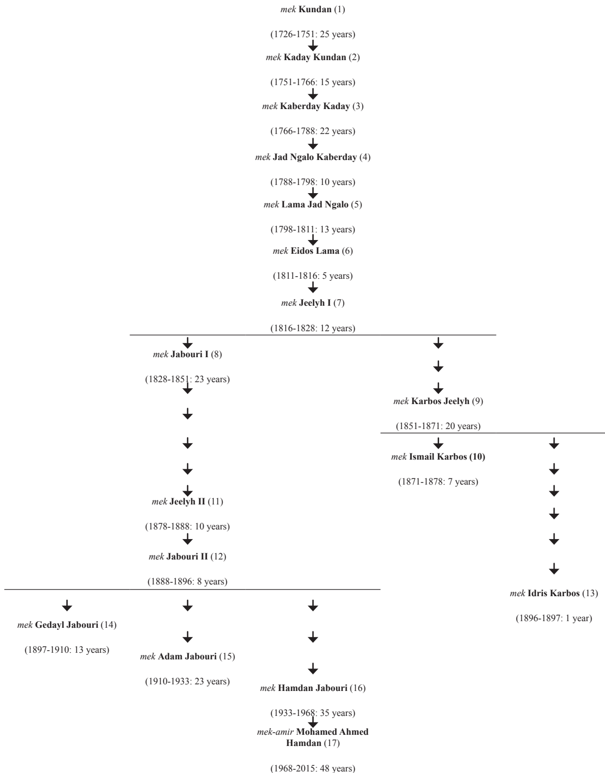
Figure (1): A Complete List of the Line of Succession to the Tagoi Throne

and finally small red locusts. All those pairs lived as one family. Over time, the pairs of leopards, serpents, lions, and bees were expelled, for misconduct, into the wilderness; the human and locust pairs remained with their parents. The father then was attuned to advise his wife, whenever he wanted to leave the house, that she should not give the pair of locusts a chance to know where the grains were stored. One day, keeping an eye by stealth on their mother, the