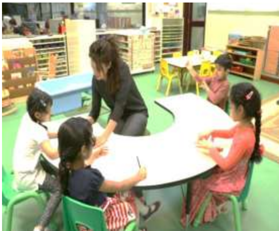
Figure 1: Teacher To Student Ratio