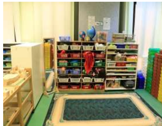
Figure 2: Classroom Environment

The classrooms are painted in neutral colors and the walls are not decorated, thus reducing visual stimuli and unnecessary distractions that can cause havoc to the autistic child. Because both classes run on the same timetable at the same time there are no noise distractions either (see Figure 2).