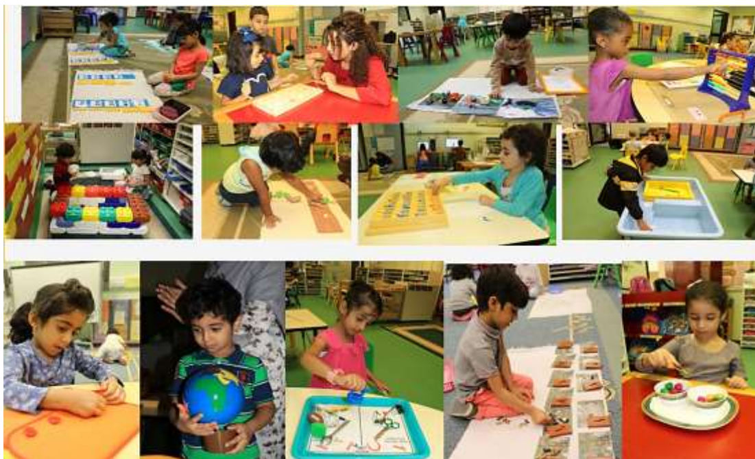
Figure 3: Individual activity

Because all activities are individualized, the child is always working at an appropriate level (see Figure 3). This reduces the frustration for the autistic child who may lack the communication skills to express their frustration appropriately. Individualized instruction also means that the child can work at their own pace. Autistic children often have a delayed response to verbal instructions and may take longer to process information and respond than the typically developing child. ( Teaching Students with Autism , 2000).