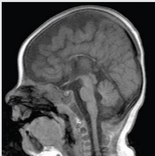
Figure 1a: Magnetic resonance imaging scan: Sag T1W SE, midline. There is hypoplasia of the corpus callosum. Optic chiasm, pituitary gland and midbrain are grossly normal.