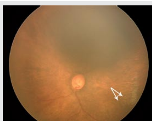
Figure 2b: RetCam fundus photo of the right eye showing large disc cupping and epiretinal pseudogliosis superior to the fovea (arrow)

clinical grounds aided by histological confirmation. The skin lesions may follow the Blaschko lines and the initial appearance of skin lesions can be seen immediately after birth or early during the neonatal period. Timely recognition of IP by pediatricians and dermatologists is therefore crucial. IP overlaps with hypomelanosis of Ito, which is a syndrome with hypopigmented whorls of the skin along the Blaschko lines, especially when it presents at the stage of skin hypopigmentation. Chromosomal mosaicism is believed to be the reason that hypomelanosis of Ito is so varied in phenotype. Certain genes, namely, those on 9q33-qter, 15q11-q13, and Xp11, have been implicated in hypomelanosis of Ito; however, no consensus exists about the identity of the hypomelanosis of Ito gene. 5,6