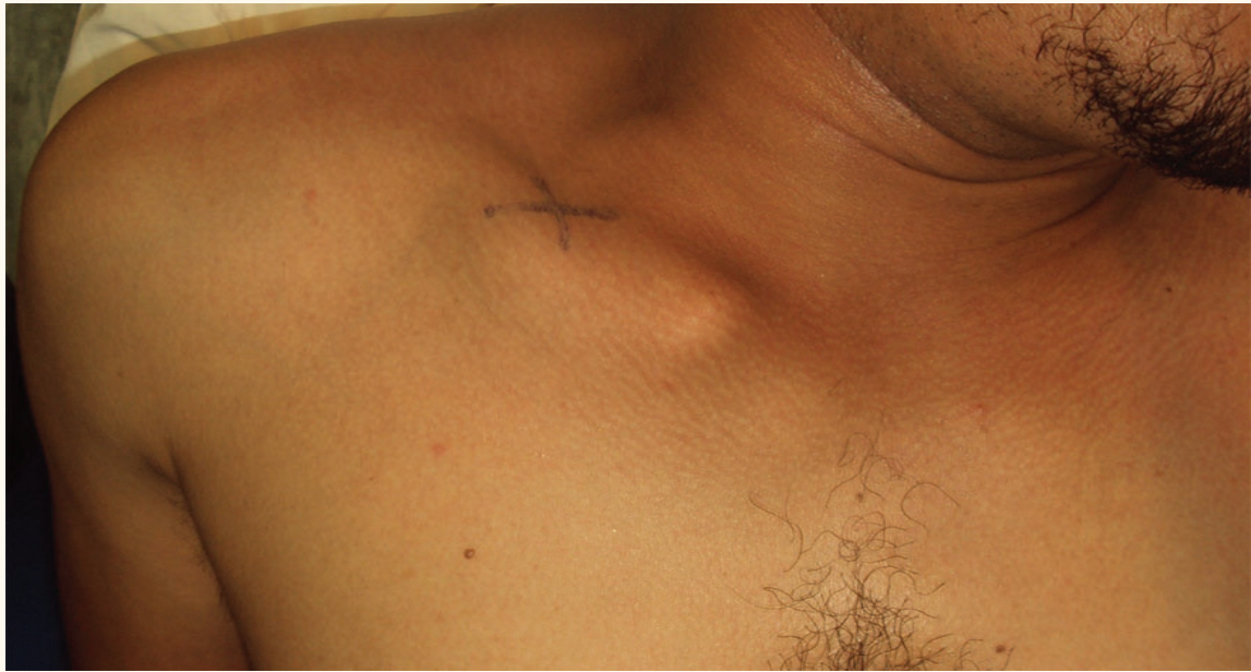
Figure 1: Clinical image of the patient shows the deformity of the anterior dislocation of the right sternoclavicular joint (SCJ) and the absence of the normal shape of the left SCJ.

intervention is often necessary by close reduction, excision and reconstruction under general anaesthesia.