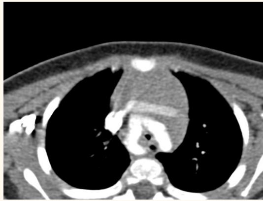
Figure 1: Axial computed tomography angiography image of the first case, demonstrating both aortic arches with a mildly compressed trachea and oesophagus.