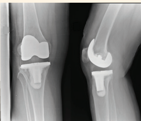
Figure 3: X-ray images of a 77-year-old woman with right-sided medialised knee pain following total knee replacement surgery. No signs of osteolysis or loosening of the prosthetic components could be seen.

tion over the tender area. Radiographs of the knee showed no evidence of osteolysis or loosening of the prosthetic components [Figure 1]. The biomechanical