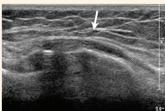
Figure 2: Ultrasound of a 70-year-old woman with intermittent pain in the left medial knee joint line following total knee replacement surgery. Note the thickened appearance of the pes anserinus insertion (arrow).