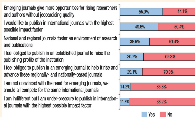
Figure 1: The attitudes of authors in the Middle East and Africa towards emerging journals (N = 127).